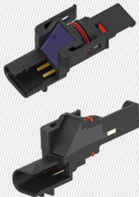
Rotation angle Hall sensor in the end-of-shaft assembly