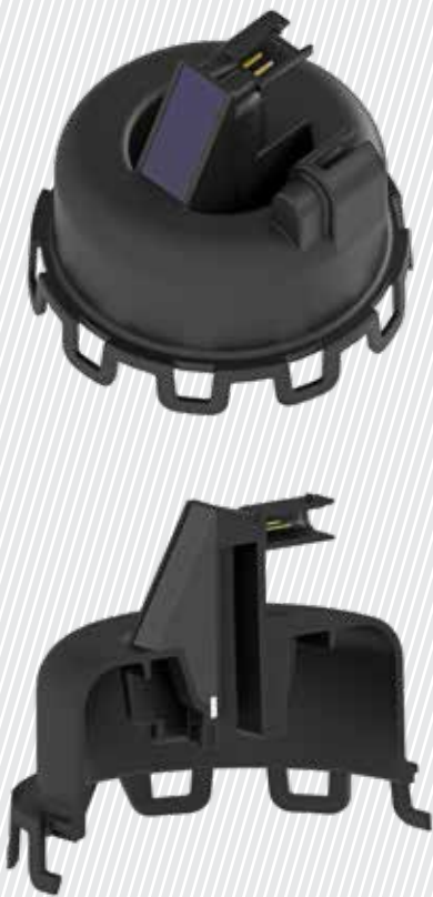
Linear Hall sensor integrated in the actuator cover of the vacuum box